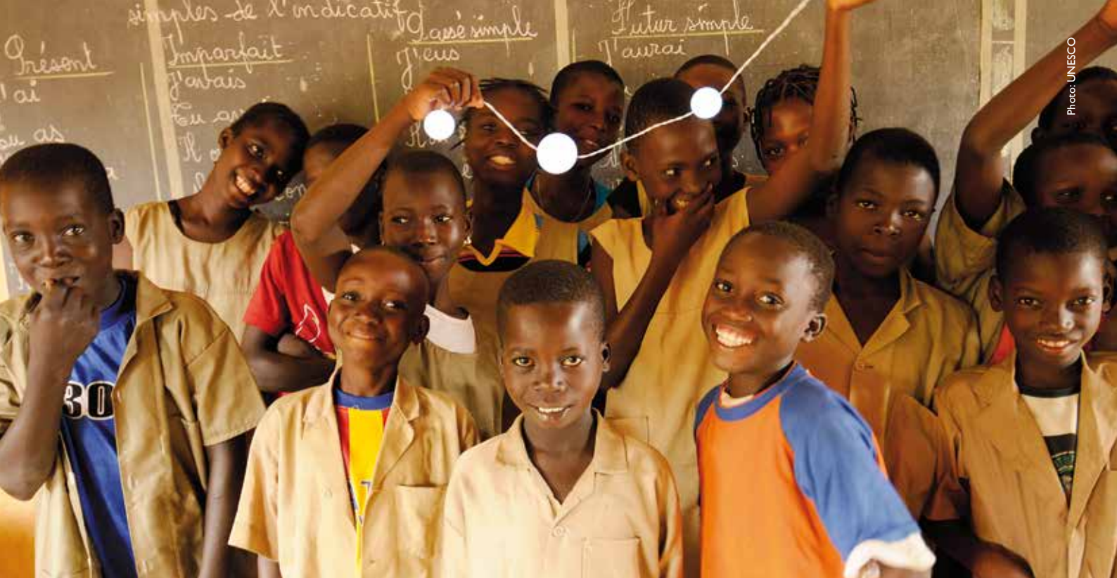
The new solar system lights up children's faces as well as their classrooms.